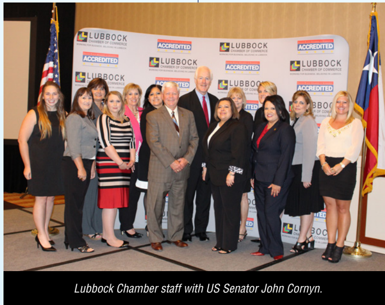
Lubbock Chamber staff with US Senator John Cornyn.