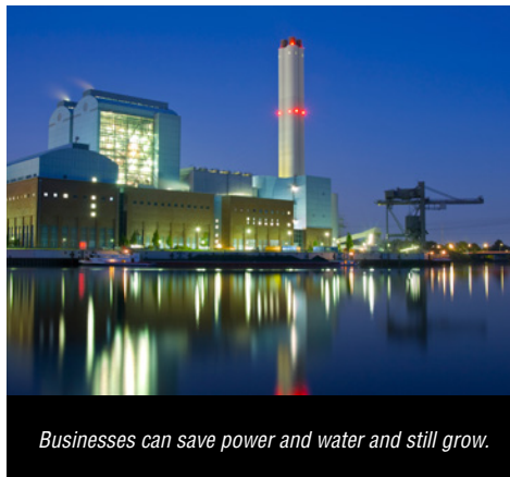
Businesses can save power and water and still grow.

Those who support mandatory conservation, however, either ignore or do not understand how a business operates and competes. Businesses survive by making wise choices about where to invest capital and energy or water conservation is the best place to invest capital, only when its rate of return exceeds all other potential investment alternatives. This is perhaps the principal reason that, as companies have struggled to continue an economic recovery, the total value of deferred maintenance on commercial and industrial property in the U.S. continues to climb to alarming levels. Those in the commercial property investment field have come to regard deferred maintenance as an increasingly dangerous threat to investment income if not properly evaluated and addressed. Much of this deferred maintenance is related to building components that directly affect energy and water utility consumption and the costs of doing business.