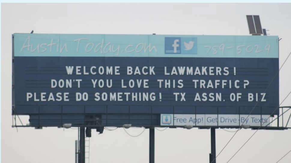
TAB welcomes Lawmakers back with a transportation message high above Interstate 35 in Austin.

A full list of our legislative priorities can be found on the TAB website at www.txbiz.org .